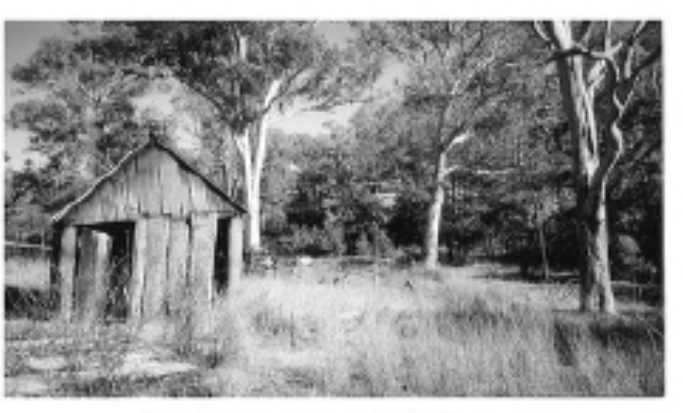
Slab Hut Ivory Creek Cattle Dip