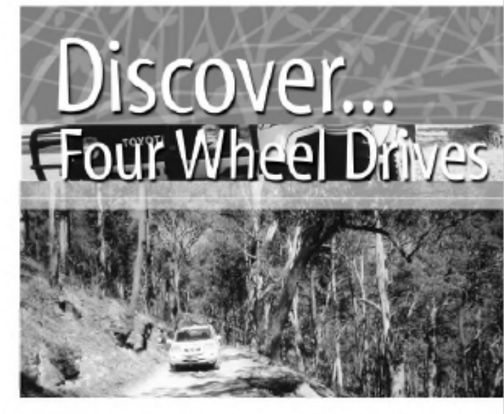
Soft four wheel driving for the family in and around the Crows Nest Region.

The drive was assessed in early 2012 in a VW Amarok. Some challenging sections.