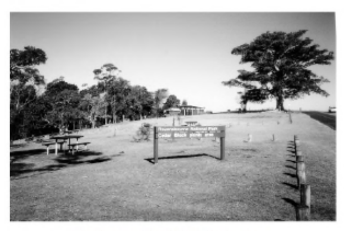
Picnic grounds at Beutel's Lookout