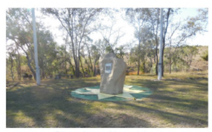
Djuan Anzac Memorial