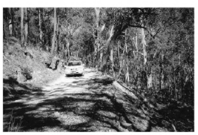
Steep decent after Wallers Rd.